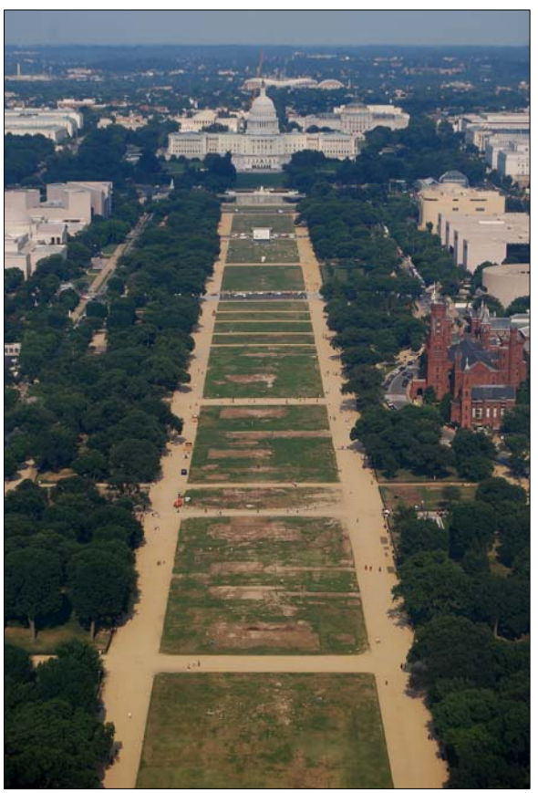
The Mall looking east from the Washington Monument.