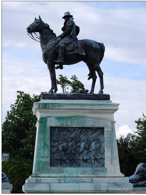
The memorial would be restored under the preferred alternative and alternatives A, B, and C.

refurbished. Edging or curbs would be installed to limit gravel migration, along with post-and-chain fencing to prevent social trails.