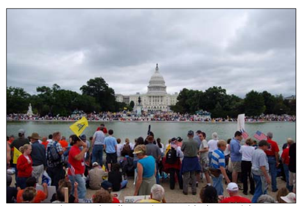
Demonstrations are legally consistent with the special nature and sanctity of the National Mall, and they will continue under all alternatives.

maintenance of public health and safety, protection of environmental and scenic values, protection of natural and cultural resources, . . . or implementation of management responsibilities, equitable allocation and use of facilities, or the avoidance of conflict among visitor use activities" (36 CFR 1.5). Regulations at 36 CFR 7.96 contain provisions specific to the greater Washington, D.C., area and figure prominently in the administration of the National Mall.