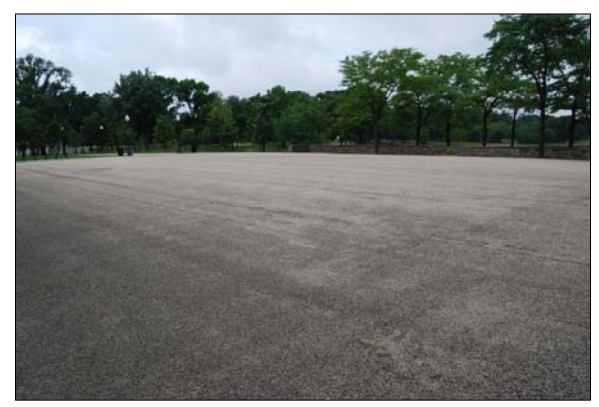
A large paved area at the east end of Constitution Gardens could accommodate a multipurpose visitor service facility.

Lockkeeper's House could be relocated away from the corner of 17th and Constitution Avenue NW and adaptively reused.