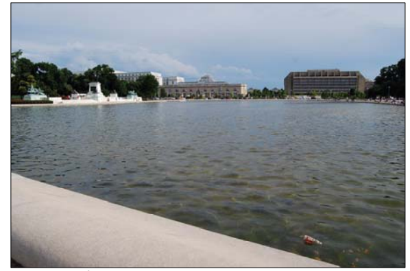
A smaller reflecting pool at Union Square would be considered under some alternatives to make the space more suited to various uses and to improve pedestrian circulation.

fied day and evening destination, and it could be easily transformed into a larger venue for First Amendment demonstrations and events. The historic east-west vista between the U.S. Capitol and the Washington Monument would be improved and perpetuated.