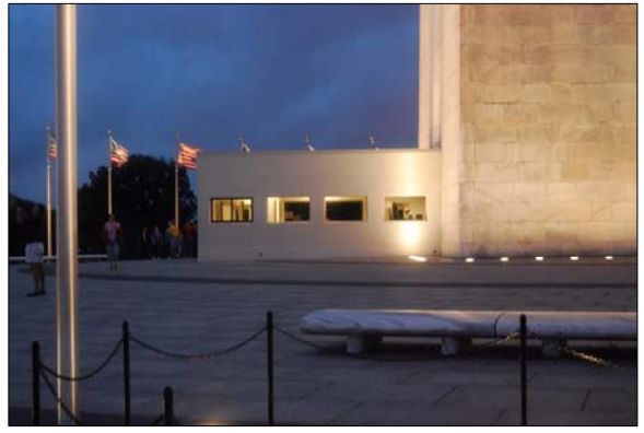
An ongoing project is the removal of the temporary security screening building on the east side of the Washington Monument.

and special events, including utility infrastructure. A multipurpose visitor destination facility with food service, restrooms, retail, and performance space would be developed.