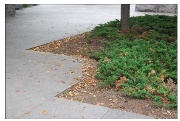
Visitor use patterns would be assessed in areas where vegetation is being trampled.

future Martin Luther King, Jr. Memorial. Visitor use patterns would be assessed to determine how to protect vegetation in areas where it is being trampled.