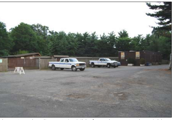
The U.S. Park Police area is visible from the JFK Hockey Fields to the north.