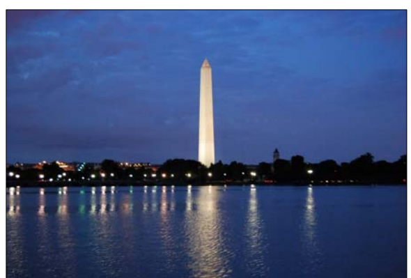
The Washington Monument is a focal point at night, as well as during the day.